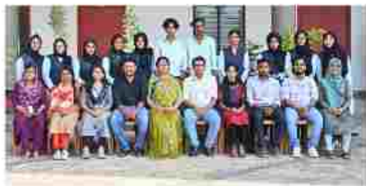
B. A. Functional English