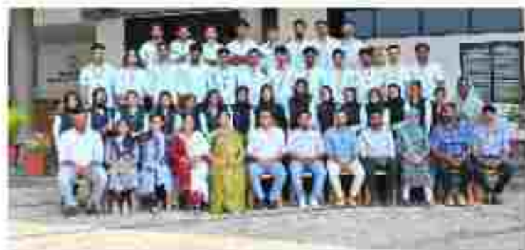
B. Com Finance