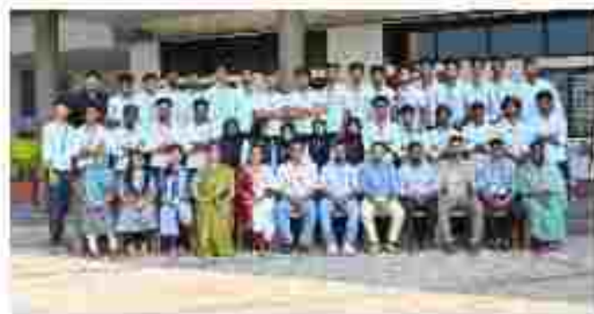
B. Com Taxation